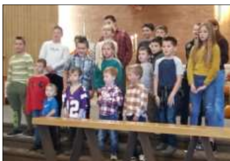
Children's Choir November 19, 2023