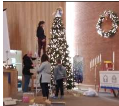
Service Work Group 3 decorating for Christmas

Thank you for your financial support of the church. Contributions may be dropped off or mailed to the church office if you are unable to make it to worship. Please have all 2023 contributions in to the church office by noon Thursday, December 28. Please do not take contributions to Prairie Sun Bank as they will not be recorded. If giving online, please do so by Tuesday, December 26 th to be processed for the 2023 year. We will NOT be extending the deadline for 2023 contributions into the 2024 year. Thank you for your contributions!